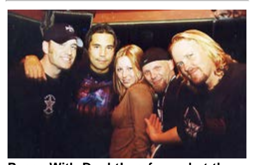
Peace With Doubt! performed at the after-party November 16, at the