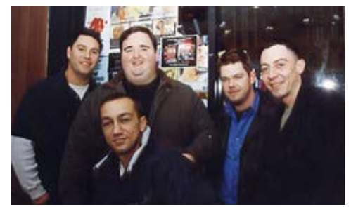
The Cast of the campy short film-"Night of the WereMike II: Attack of The Patula: War of the Pot Monsters," directed by Joe Brady (in blue shirt).