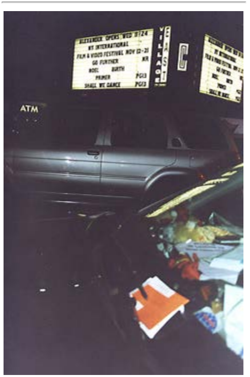
And how could an event be complete in New York City without the LPRmobile getting a ticket from one of the swarms of officials sent by the finemeister to consume us. Ah... for a movie about PVB in NYC.