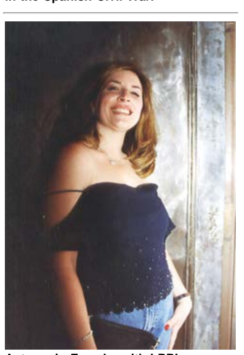
Actress in Facade, with LPR's apologies for misplacing card with her name.