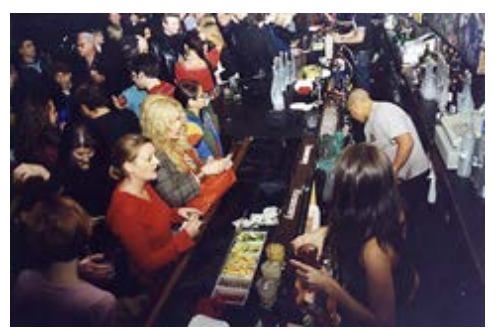
Scene at the after-party November 15th at The Dark Light.