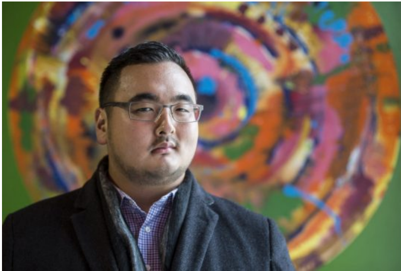
BERNARD WEIL / TORONTO STAR

For him, the program will be about “connecting people with other people or with the skills that they need to be successful and then connecting people with their communities.”